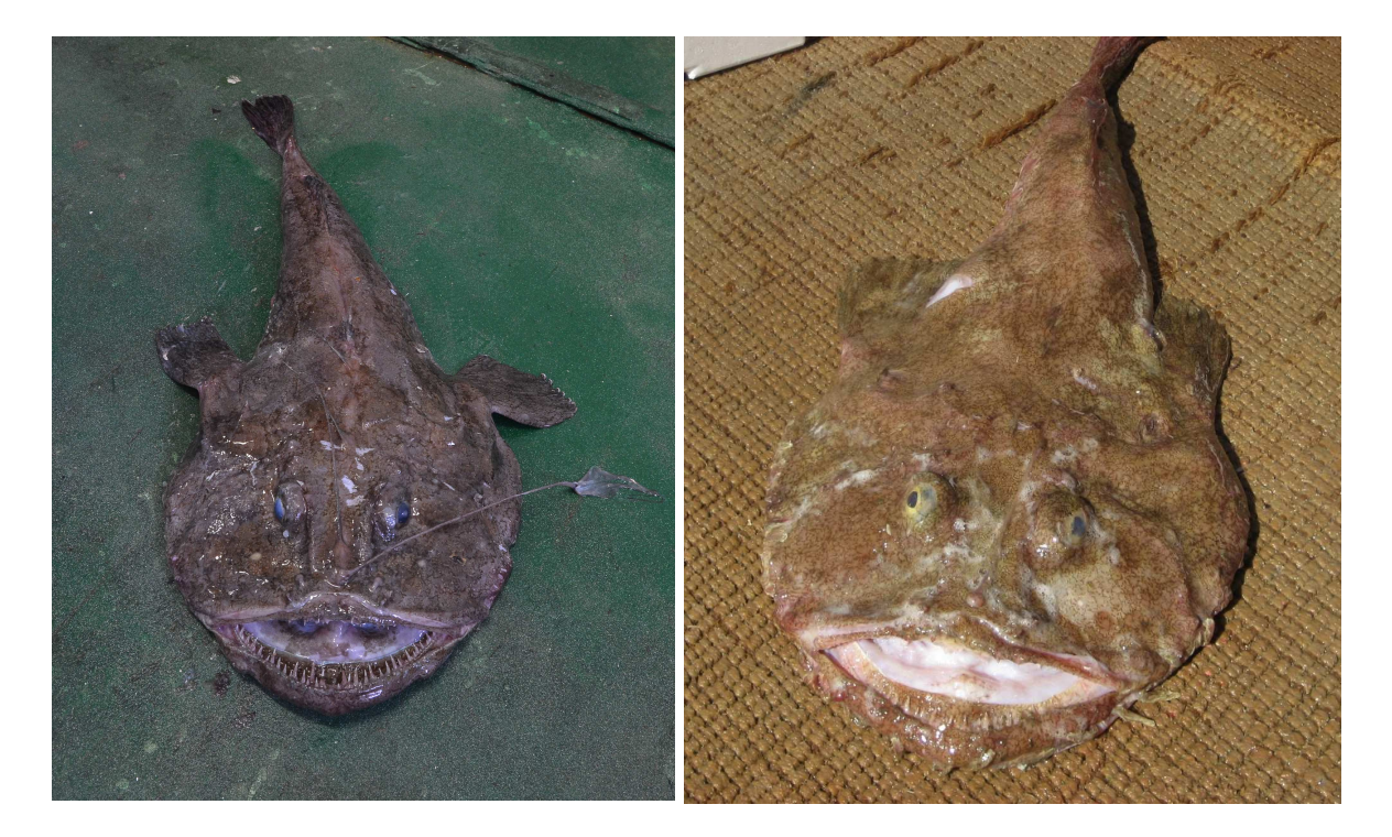
Fig. 2.1.2. Monkfish, Lophius piscatorius (left) and blackbellied anglerfish, Lophius budegassa (right).

results obtained showed an overfishing condition. At present, no stock assessments are available for L. piscatorius in the Mediterranean; evaluations on the exploitation status of this species have been performed in Atlantic, Faroe Islands (Ofstad et al., 2013), showing that the species is suffering the excessive fishing pressure. Nowadays, no specific management measures for the two Lophius speces are applied in Mediterranean. No minimum landing size has been established for the two species in accordance with EU Reg. No. 1967/2006.