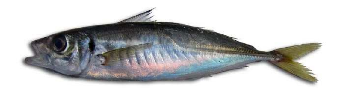
Fig. 2.2.2. Mediterranean horse mackerel, Trachurus mediterraneus

species with maximum longevity of 10-12 years reported in the past (Stoyanov et al., 1963), but nowadays the age of most of the individuals in the Black Sea population does not exceed 6 years. The horse mackerel matures at the age of 1-2 years in spring-summer (May-August), when the main feeding and growth season also takes place. It spawns in the upper layers, mainly in the open part of the sea as well as near the coast (Stoyanov et al. 1963; STEFC 2017b).