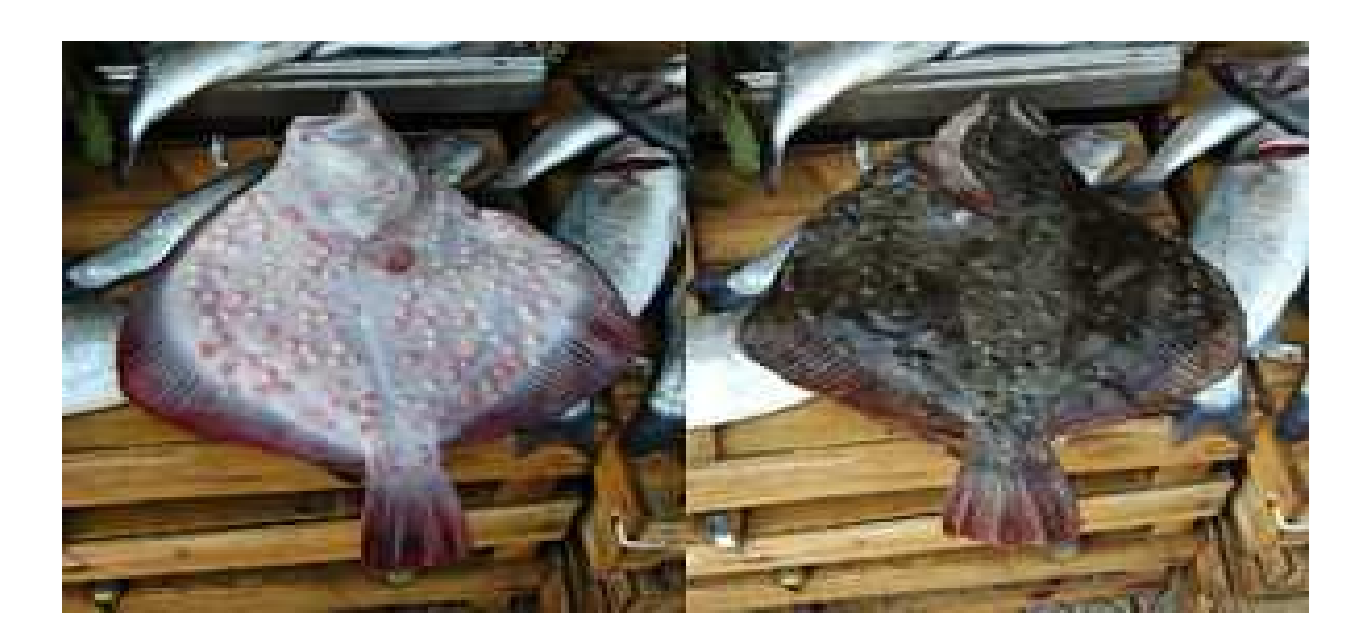
Fig. 2.2.1. Turbot, Psetta maxima, (Photo by Valodia Maximov)

Turbot, Psetta maxima , (Fig. 2.2.1) is a large, broad-bodied left-eyed demersal flatfish that belongs to the family Scophthalmidae. Its geographical range extends from Icelandic seas to the Mediterranean, including the Sea of Marmara, and the Black Sea (Blanquer et al., 1992). The turbot is one of the most important commercial fish species in the Black Sea, where it is heavily fished using otter trawls, gillnets, beach seines, and trammel nets (Aydin and Sahin, 2011).