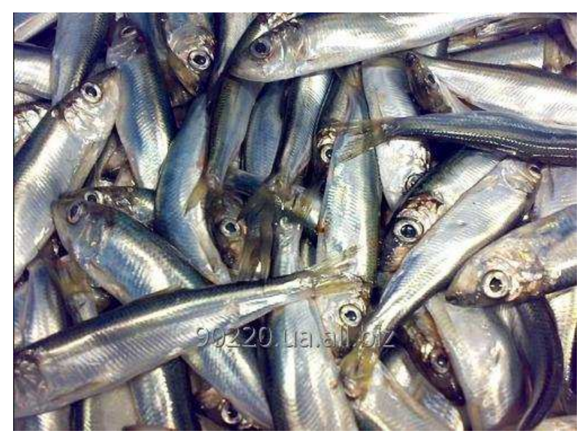
Fig. 2.2.3. Sprat, Sprattus sprattus

well as for the marine predators (including other commercial fish such as whiting and turbot) and the ecosystem as a whole (Daskalov et al 2008, Shlyakhov and Daskalov 2008). Together with the anchovy, sprat is one of the most abundant, planktivorous, pelagic species. The level of its stocks depends on the conditions of the environment mainly and on the fishing effort. The changes in the environment due to anthropogenic influence affect the dry land as well as the world ocean. The level of the sea pollution and its "self-purifying" ability are completely different. There is a clear indication of changes in the nature equilibrium in the corresponding ecological niches. The greatest impact in the world ocean is played by commercial fisheries, which directly devastate a significant part of the given species populations. As a result of this, some of the species stocks are declined or depleted.